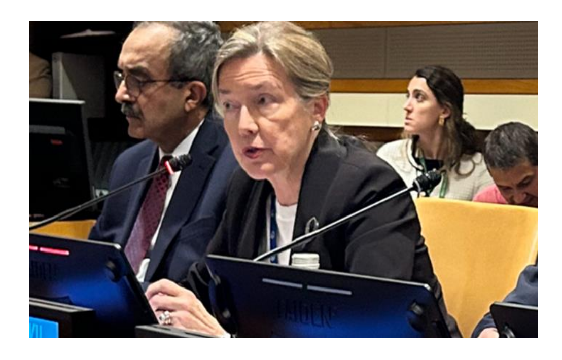
Speech by the Permanent Representative of Finland to the UN Ms. Elina Kalkku

Elina Kalkku emphasized that on the International Day for Preventing the Exploitation of the Environment in War, representatives from various countries gathered at the UN to support Ukraine, which is fighting for its sovereignty, while other countries also suffer from war-related destruction, including Sudan, the Palestinian territories, and others. She reminded that lasting peace cannot be built on foreign domination or dictation. Today's event followed a high-level working group meeting attended by the Prime Minister of Ukraine.