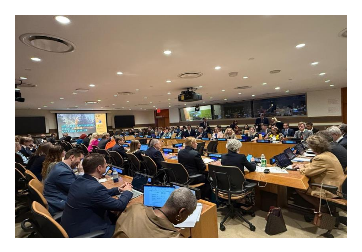
Participants of the seminar, representatives of governments, political circles, and civil organizations from over 20 countries worldwide

Among the statutory tasks of the Ukrainian Peace Council is addressing the most pressing issues that concern the civil society of Ukraine and impact the well-being of our citizens. In particular, environmental problems, especially critical during wartime, affect the future life and development of the state. Recognizing this as one of the fundamental values for the development and survival of humanity, the Ukrainian Peace Council, in close cooperation with the Council on Environmental Safety, initiated and organized the International Forum "Ecology and Peace" in Kyiv on May 15–16, 2024. The event received widespread recognition both in Ukraine and abroad.