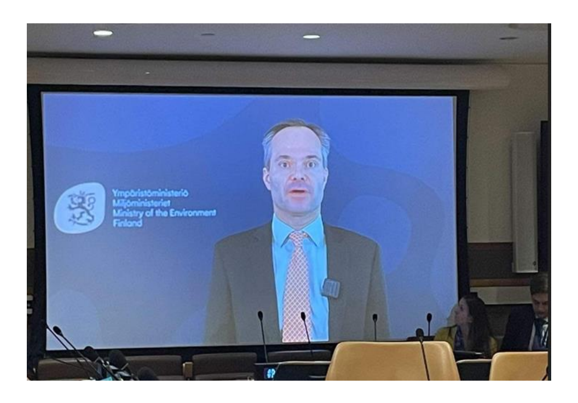
Speech by the Minister of Climate and Environment of Finland, Mr. Kai Mykkänen

The Minister of Climate and Environment of Finland, Mr. Kai Mykkänen, emphasized that Ukraine is defending its right to exist as a sovereign nation while also fighting against colonialism on behalf of the entire democratic world. He stated: "It is a great honor for me to report on the international conference on environmental security held in Helsinki on October 19, 2024. It was a pleasure to share this conference with my colleague, the Ukrainian Minister Svitlana Hrynchuk. During the conference, we identified four key aspects of this issue: assessing the damage and destruction of Ukraine's natural environment, ensuring accountability for inflicted damage, restoring the environment damaged by the war, and enhancing resilience to climate change and future environmental disasters. Based on President Zelensky's Peace Formula, we support the work of the international group on these matters, which completed the first stage of its work in February 2024. The group continues to assist the Ukrainian government in implementing environmental recommendations."