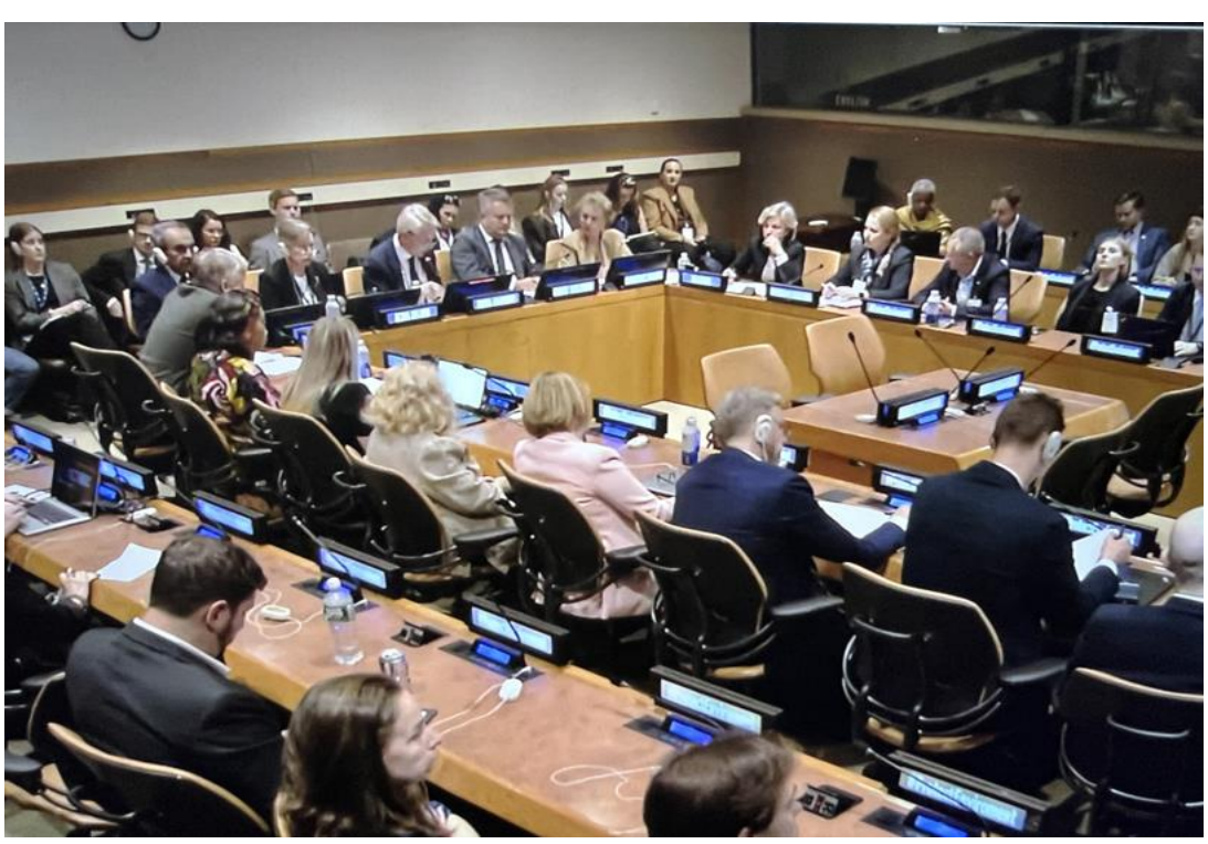
Conference Hall of the United Nations Headquarters